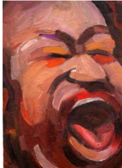
Head study oil/canvas board 5"x7"