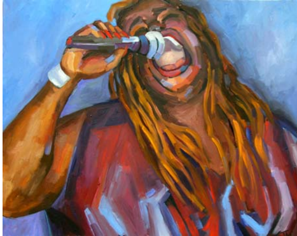
Wicked oil/gator board 20"x16"