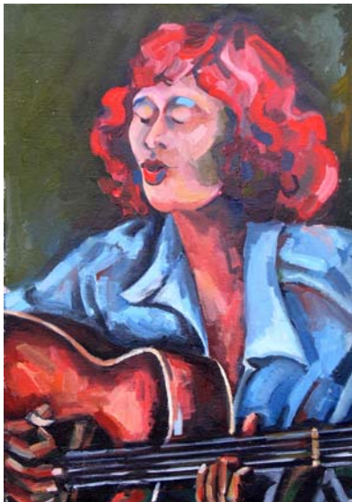
Diving Duck Blues o/c 11 1/2"x16"

Shemekia is the daughter of the late blues legend Johnny Copeland.