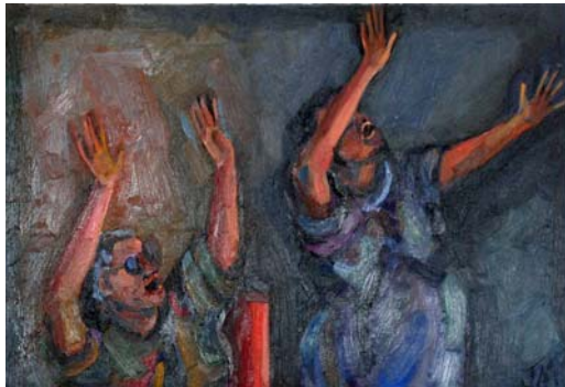
Celebration oil/gator board 9 1/2"x6"