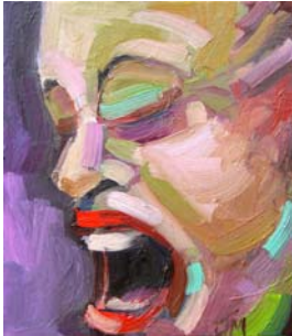
Head Study o/c 5 1/2"x6"