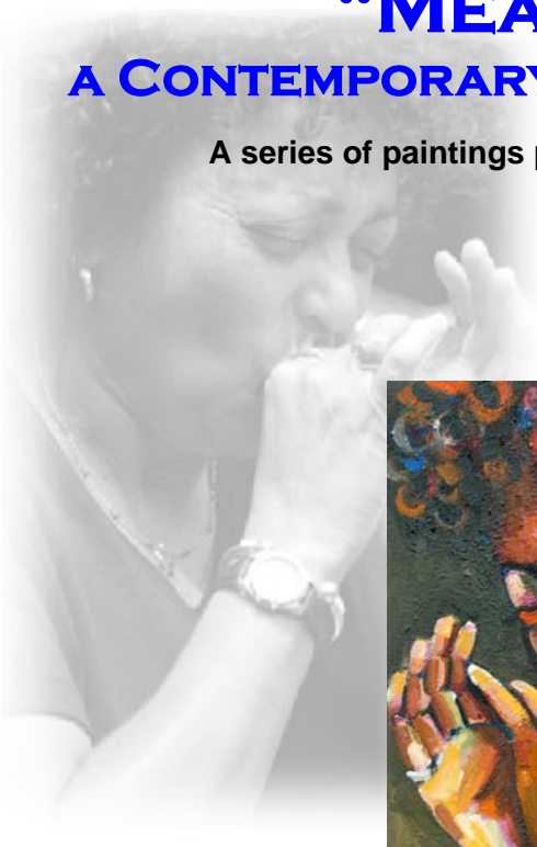
Self Portrait o/c 11"x14"

A series of paintings portraying women blues musicians,