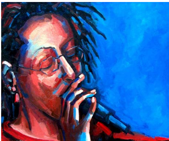
Since I Fell For You o/c 20"x16"