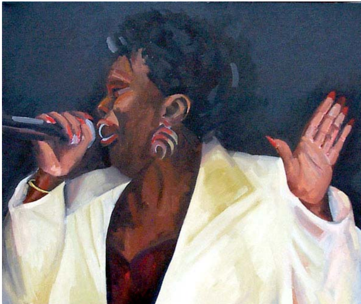
Wear it Out oil/gator board 18"x24"