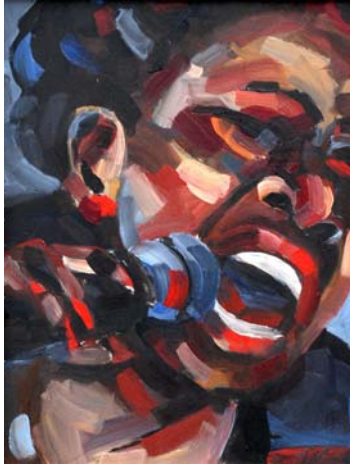
It's not about the Melody oil/gator board 6"x7 3/4"